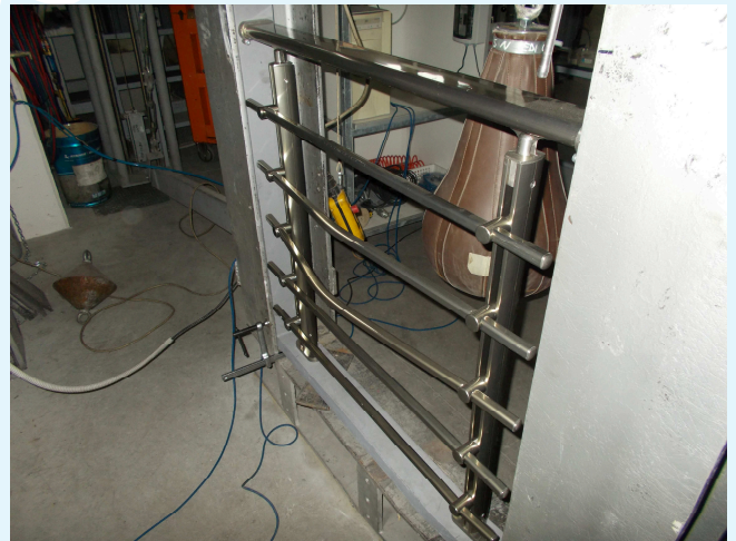
Photographs of the sample before and after impact